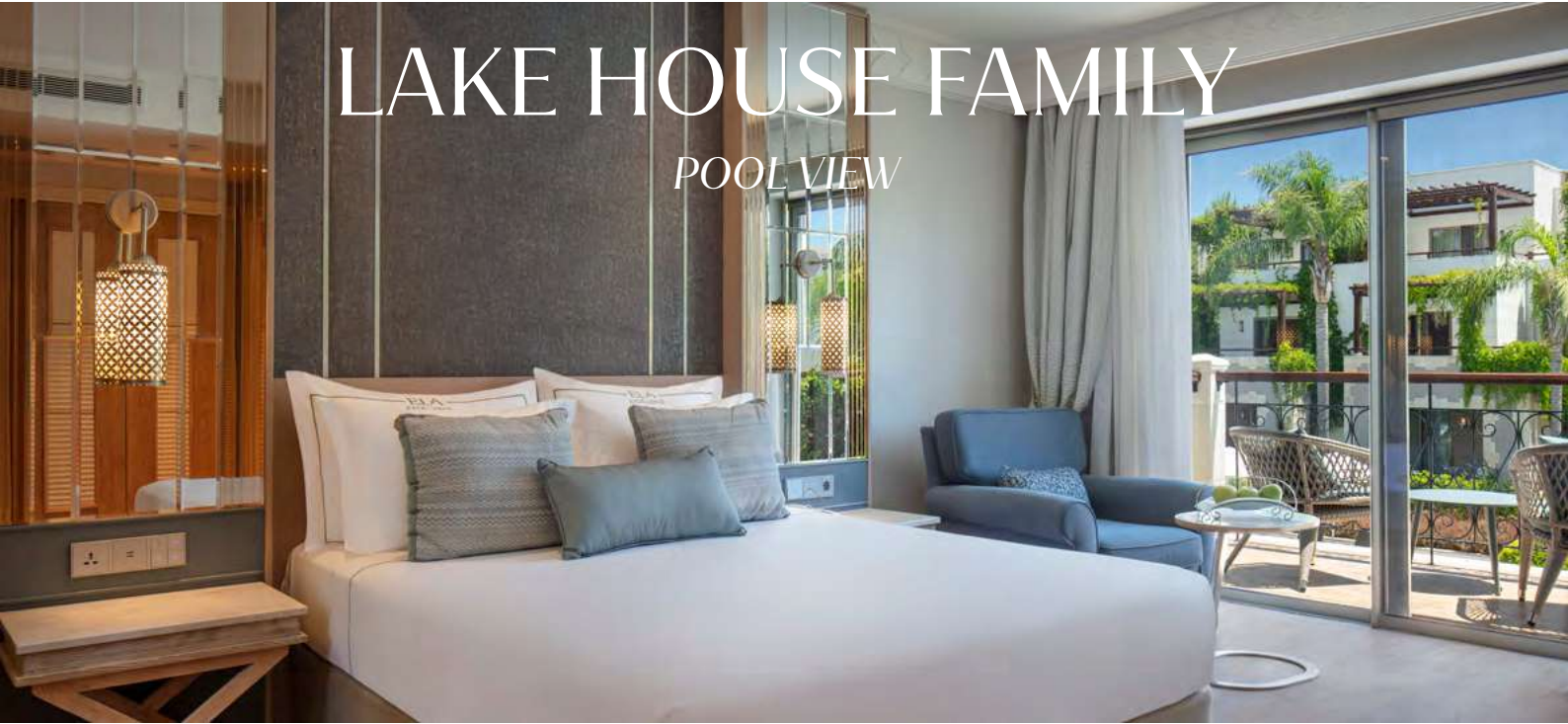
Lake House | 76 m 2 | 4 Adults + 1 Child

It is one of the most ideal room designs where you can enjoy the pool with your family after a walk in a lush nature. The Lake House family room offers an unforgettable vacation experience with your family inside the charming beauty of nature. Consisting of two separate bedrooms connected, these large and spacious rooms are designed for the comfort of families in every detail. You can feel the tranquility of nature through the balcony overlooking the lake.