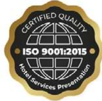
ISO 9001:2015 Quality Management System