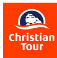
CHRISTIAN TOUR - BEST ACCOMMODATION AWARD 2022