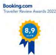
BOOKING.COM - TRAVELLER REVIEW AWARDS 2022: 8,9/10