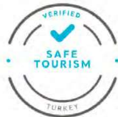
Safe Tourism Certificate