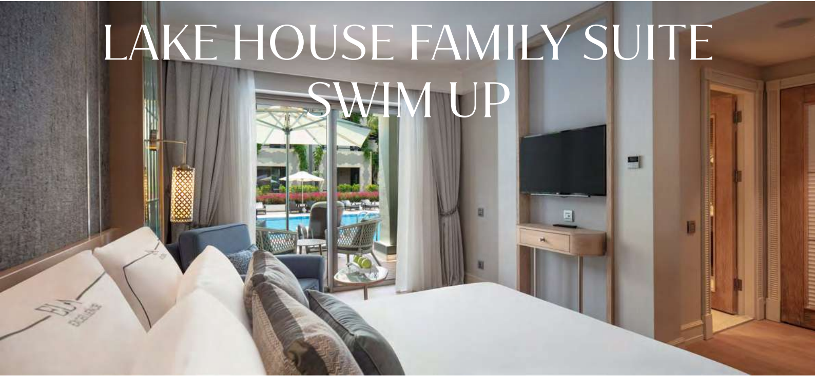
Lake House | 76 m 2 | 4 Adults + 1 Child

When you close your eyes and take a deep breath, you will realize that this moment is exactly the vacation experience you have been dreaming of.