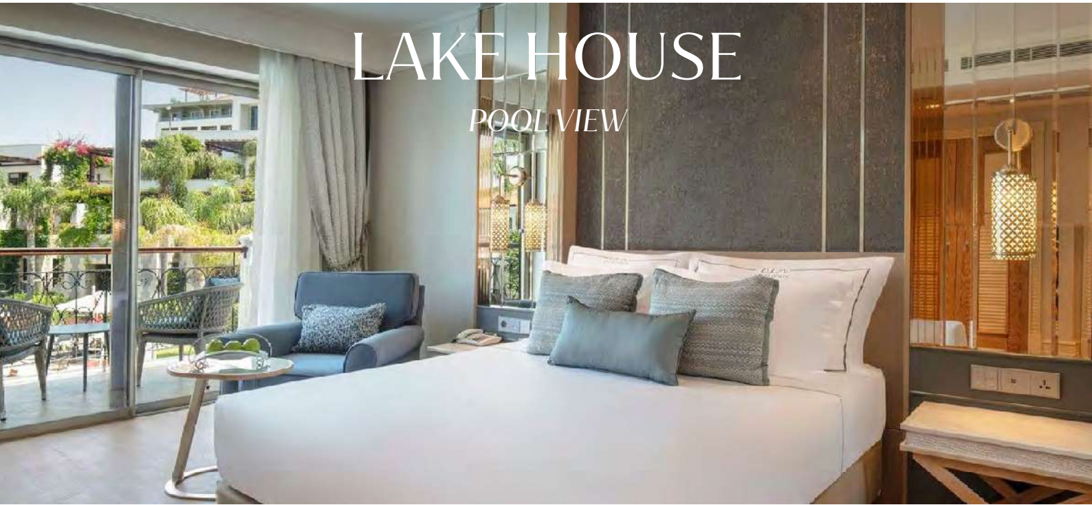
Lake House | 38 m 2 | 2 Adults + 1 Child

Enjoy a luxurious vacation in touch with nature in the Lake House Pool View room, which crowns every shade of green with Ela's elegant and charming touch.