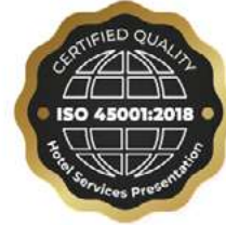
ISO 45001:2018 Occupational Health and Safety Management System