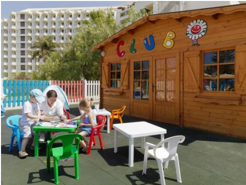
DAISY CLUB PLAYHOUSE