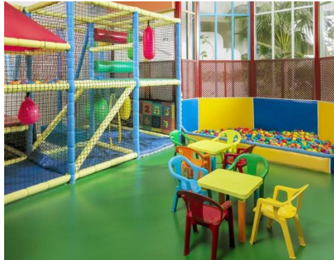
PLAYGROUND WITH BALL POOL