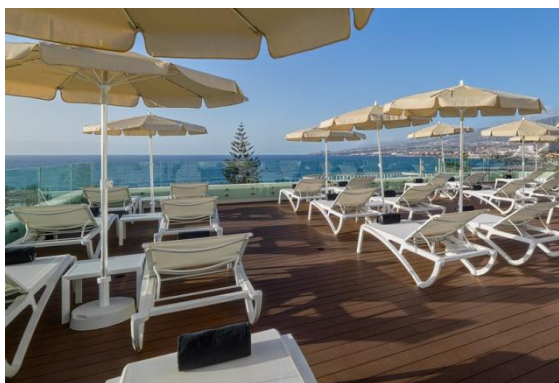
PRIVILEGE LOUNGE TERRACE