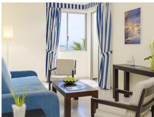
SEA VIEW JUNIOR SUITE LIVING ROOM

Welcome gift Nespresso machine Non-alcoholic welcome drinks (no restocking) Pillow menu, pillow-top mattress, bathrobe, slippers and pool towels Complimentary in-room safe Magnifying mirror Room cleaning and preparation twice a day and night-time turndown service