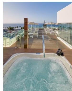
PRIVILEGE LOUNGE TERRACE