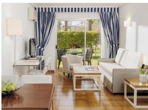
FAMILY ROOM LIVING ROOM

Privilege Junior Suites: bright and spacious rooms measuring 42 m 2 with a bedroom area, separate living room and terrace overlooking the sea. They offer all the comforts of the Privilege Rooms plus an 80 cm x 1.90 m sofa bed. They come with a 1.80 x 2 m double bed or two 90 cm x 2 m twin beds. They can accommodate up to 3 people.