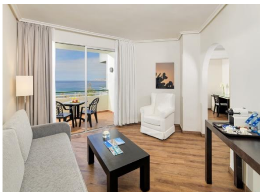
PRIVILEGE JUNIOR SUITE LIVING ROOM

Privilege Junior Suites: bright and spacious rooms measuring 42 m 2 with a bedroom area, separate living room and terrace overlooking the sea. They offer all the comforts of the Privilege Rooms plus an 80 cm x 1.90 m sofa bed. They come with a 1.80 x 2 m double bed or two 90 cm x 2 m twin beds. They can accommodate up to 3 people.