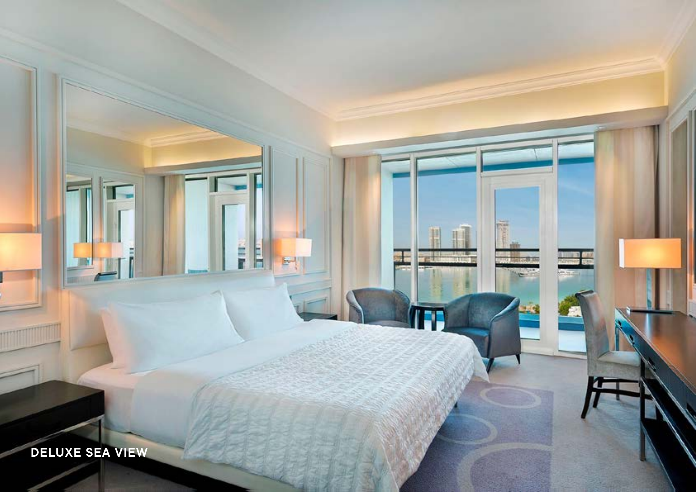
DELUXE SEA VIEW