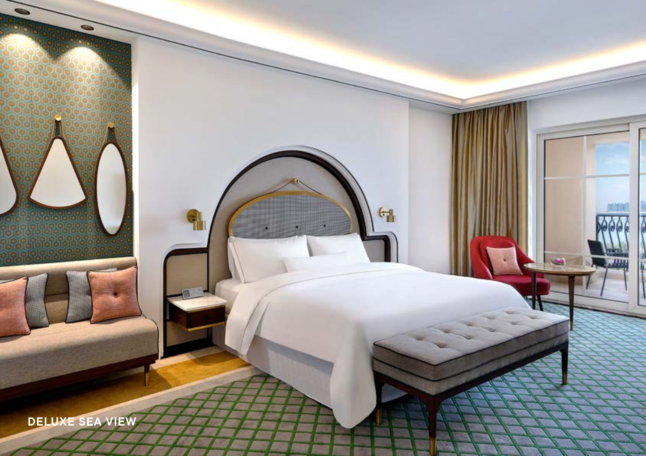
DELUXE SEA VIEW