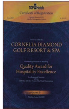
TOPHOTELS – AWARD for EXCELLENCE