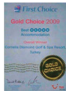
FIRST CHOICE GOLD CHOICE