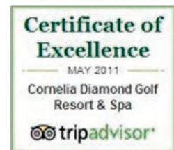
TRIP ADVISOR – CERTIFICATE OF EXCELLENCE