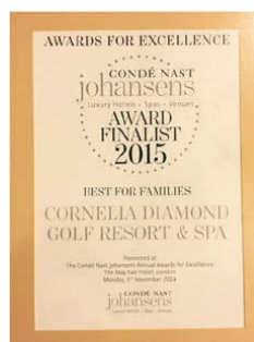
CONDE NAST JOHANSSENS