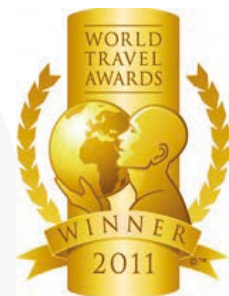
WTA – Europe's Leading Resort Villa