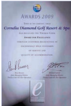
AWARD for EXCELLENCE

2025 SUMMER SEASON CONCEPT (05 MAY- 15 OCTOBER)