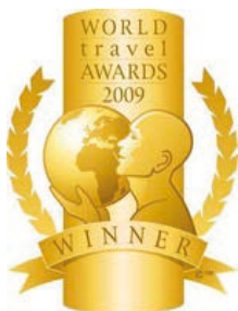
WTA – Europe's Leading Golf Resort