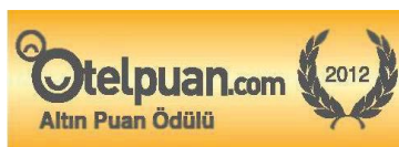
OTEL PUAN GOLD