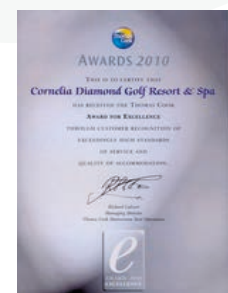
MARK for EXCELLENCE