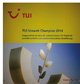
TUI – UMWELT CHAMPION