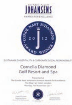
CONDE NAST JOHANSENS – WINNER (Sustainable Hospitality and Corporate Social Responsibility 2012)