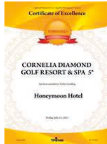
TOPHOTELS – Turkey's Leading Honeymoon