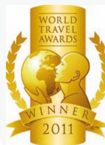
WTA – World's Leading Fully Integrated Resort