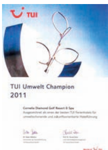
TUI – UMWELT CHAMPION