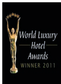
WORLD LUXURY – BEST LUXURY SPA RESORT