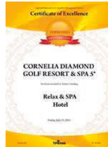
TOPHOTELS – Turkey's Leading Relax & SPA