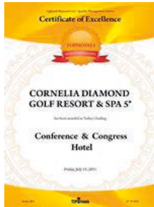
TOPHOTELS – Turkey's Leading Conference

2025 SUMMER SEASON CONCEPT (05 MAY- 15 OCTOBER)