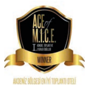
ACE of MICE – Best Congress Hotel in Antalya