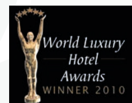
WORLD LUXURY – BEST LUXURY GOLF RESORT