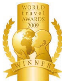
WTA – Turkey's Leading Spa Resort