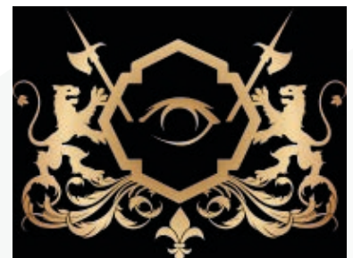
EYE AWARD – EUROPE'S BEST SPORT HOTEL