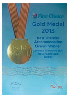
FIRST CHOICE – GOLD CHOICE