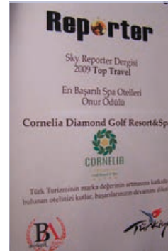
REPORTER MAG. – BEST SPA HOTEL