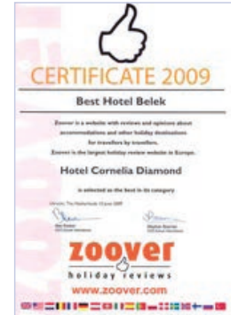
ZOOVER – BEST HOTEL BELEK