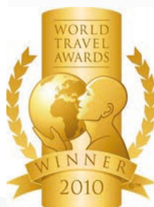
WTA – Europe's Leading Spa Resort