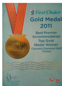
FIRST CHOICE – GOLD MEDAL