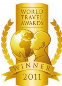
WTA – Europe's Leading Luxury Resort