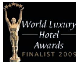
WORLD LUXURY – LUXURY GOLF RESORT