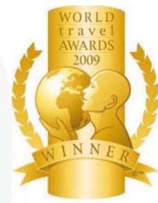
WTA – Europe's Leading Spa Resort