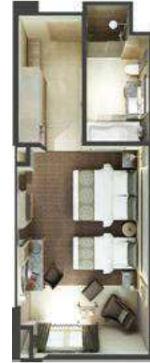
Deluxe Pool Room