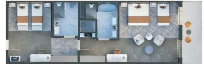
Deluxe Superior Plus Family Room