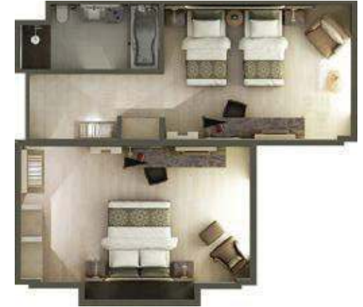
Deluxe Pool Family Room