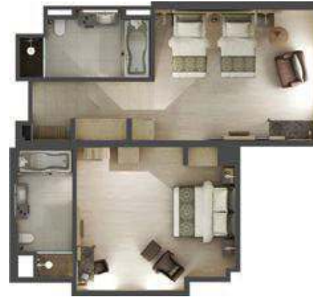
Superior Family Room