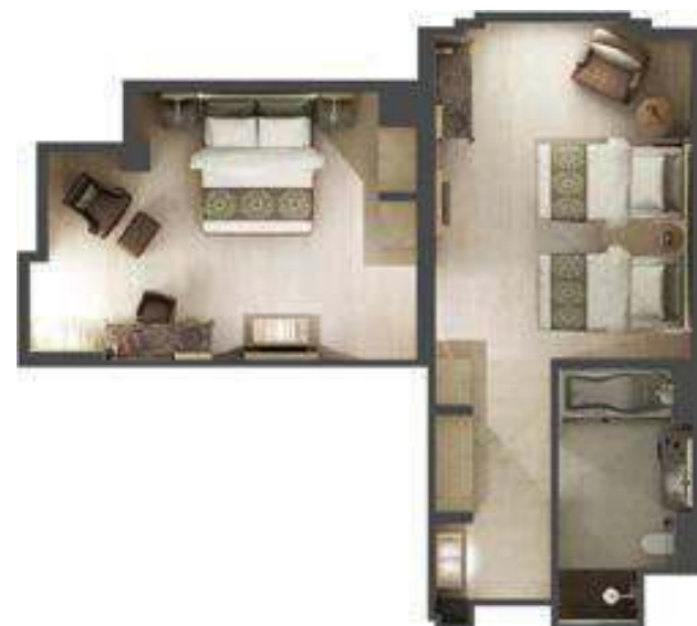
Deluxe Family Room