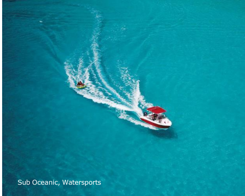
Sub Oceanic, Watersports

reservations@sirrufenfushi.com | www.sirrufenfushi.com