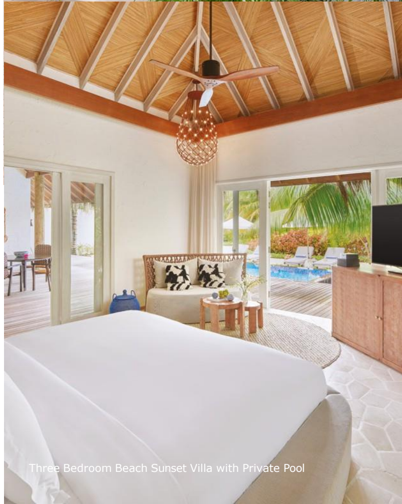
Three Bedroom Beach Sunset Villa with Private Pool