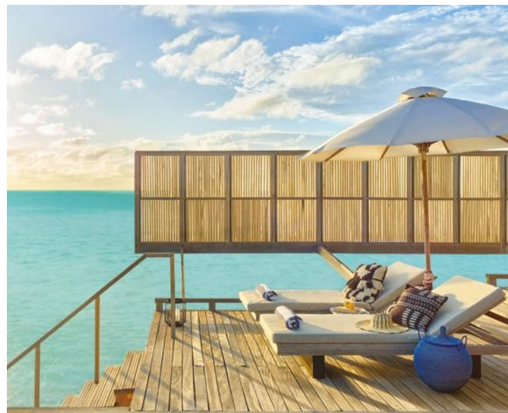
Two Bedroom Water Sunset Villa with Private Pool