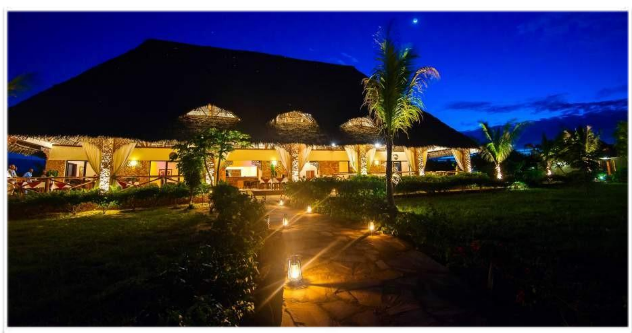
RESTAURANT Restaurant with big veranda overlooking the property and facing the garden