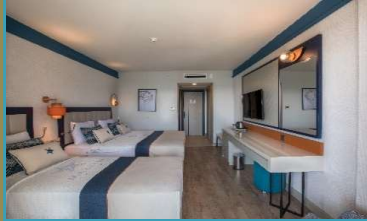
Std. Land View Room