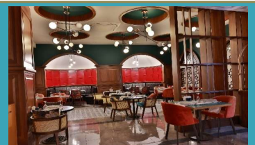
Turk A la Carte Restaurant