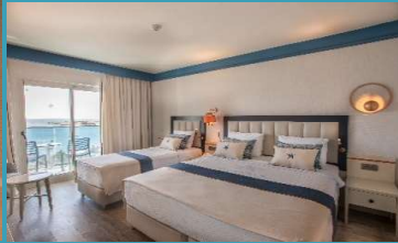
Std. Direct Sea View Room