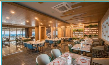
Yakamoz Main Restaurant