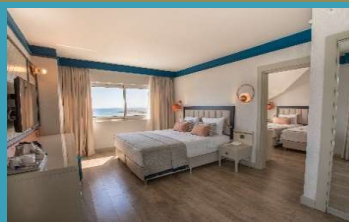
1+1 Direct Sea View Family Corner Suite