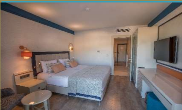
1+1 Side Sea View Family Room