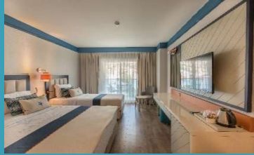
Std. Side Sea View Room