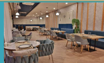
Ege A la Carte Restaurant