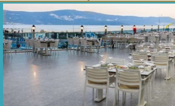
Fish A la Carte Restaurant