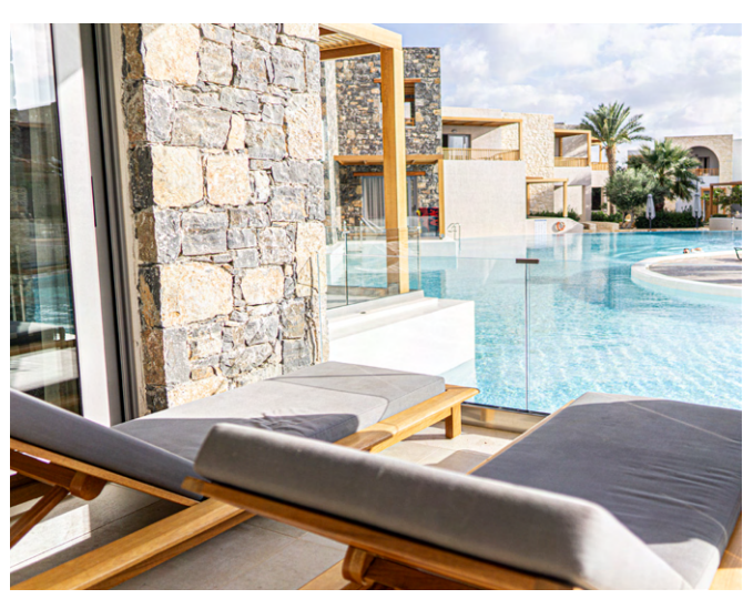
Pool Access (Zen Pool)

From 30 -34 m2 depending on the occupancy. The same interior layout & furnishing but located on the 1st floor and overviewing the Zen pool.