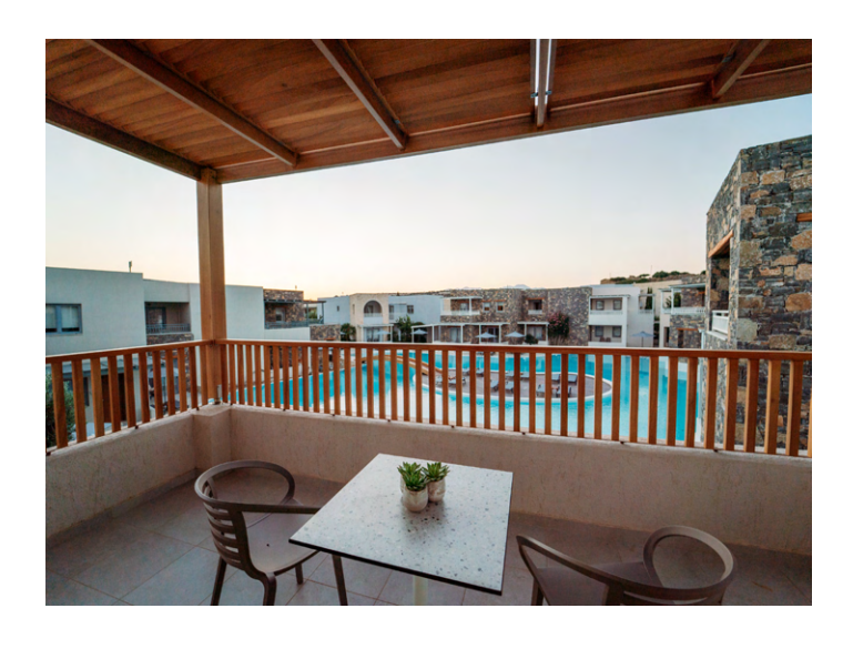
Pool (Zen Pool)

From 28 -30 m2 depending on the occupancy. Located on the 1st floor with views to the Libyan Sea. Monochrome décor and handmade furnishing. In alignment with ecological awareness and the rules of sustainable development, wooden oak furniture and natural materials. Comfortable, simple minimalist lines create a sophisticated look. Complemented by Cretan sunlight it feels almost meditative.