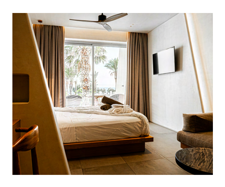
Garden (2 decorations, furnishing)

From 28 -38 m2 depending on the occupancy. Located in various areas around the Resort with views on the lush gardens. Can be on the ground or 1st floor.